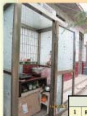
A small kitchen built outside the clinic