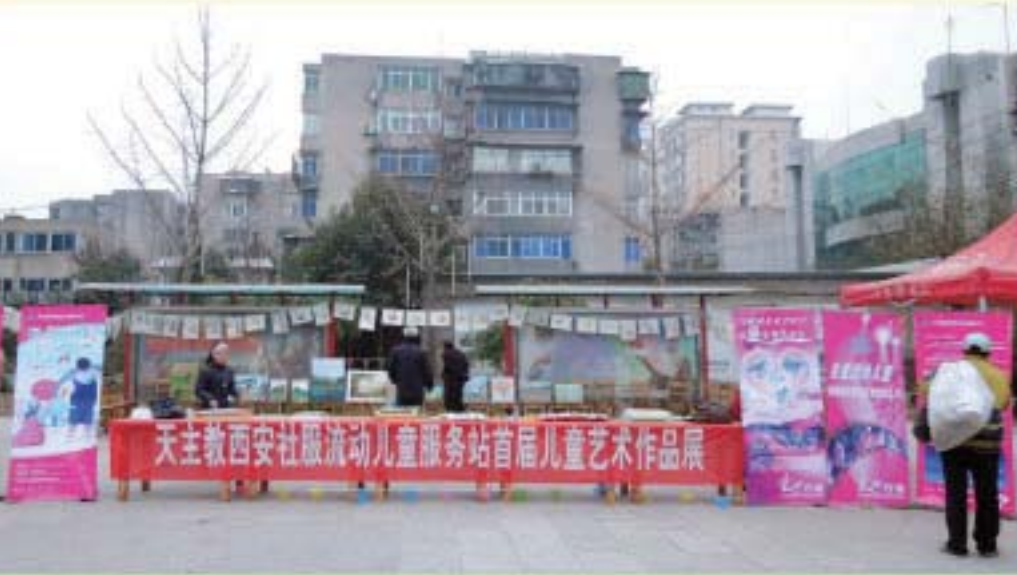
Children's art exhibition

Services offered by Shaanxi Xiaoci Social Work Development Centre (Xiao-ci implies love between parents and children) • Home visits and guidance for special needy cases. • Parenting classes for the family. • Child care and tutorial guidance. • Classes/activities of interest to children. • Activities to promote parent-child relationships. • Summer/winter camps, outings, and festive activities.