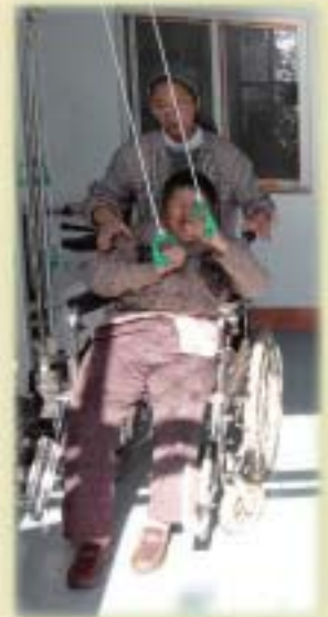
Rehabilitation and exercise equipment for elderly mobility

We now have at least 3 to 4 patients from the community coming to the centre for treatment each day. The results are beyond our expectations and are much appreciated by the elderly as well as the villagers in our community. It also brings us much happiness to witness their health steadily improving. The old folks are very thankful to the centre and to the benefactors who made this possible.