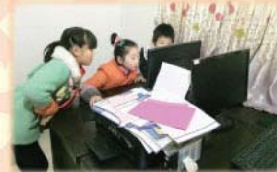
Learning to use the computer