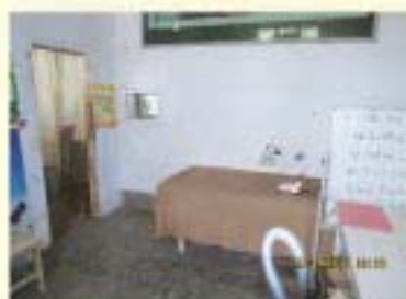
A consulting room with simple setup

This is an astronomical sum for us. Exhausting all possible resources, our congregation managed to raise only 22,000 yuan. With the 8,000 yuan contributed by the villagers, we are still short by 150,750 yuan (Editor remarks: About HK$181,626). Our parish priest suggested we write to you. We beg for your help so we in turn can help the villagers who need our services.