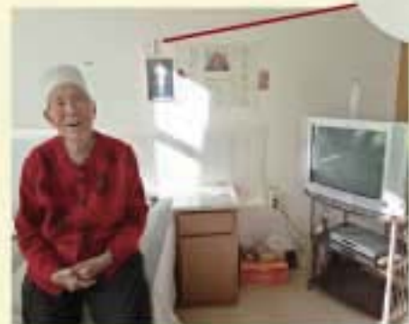
Emergency call system installed in the residents' rooms

• My mother came to the home in 2006. She has a problem with swallowing food, and it used to take the sisters more than an hour to feed her each meal, standing up. My mother has been bedridden for 10 years, and yet she's never suffered from any bedsores. We as her children could not have done better if she had stayed at home. I'm so touched by the good work of the sisters! With the addition of the fire alarm and sprinkler system, bells for emergency calls, my mind is at ease all the more.