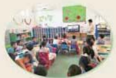
Use of TV for teaching

Since its opening in 2009 in Zhaixi, Hebei Province, the Ming-xing (Bright Star) Kindergarten has established a good reputation because of its well qualified and dedicated teaching staff. The kindergarten has more than 200 children in its care. Previously there was a serious shortage of equipment and resources to help provide a better teaching environment: only one television set shared by all the seven classes; no larger size toys for the children to play with; and a lack of air-conditioning in the classrooms which made bearing the extreme temperatures difficult for the children in both summer and winter.