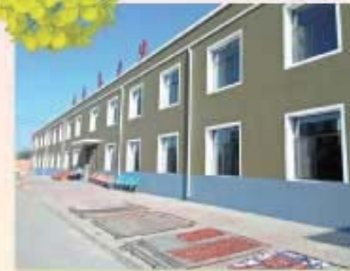
Insulation installation completed