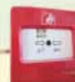
Fire alarm system