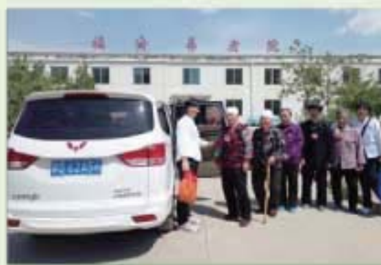
The seniors are going out for a trip

* Now fewer blankets are needed during winter ! *