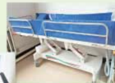
Bathing bed and chair