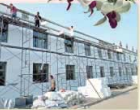
Adding Insulation to the walls

The sisters wrote to Caritas-HK for help in 2014. With a donation from Hong Kong benefactors and funds raised in the Mainland by the sisters, many improvements have been made to the premise in the last couple of years, which helped upgrade the residents' quality of life.