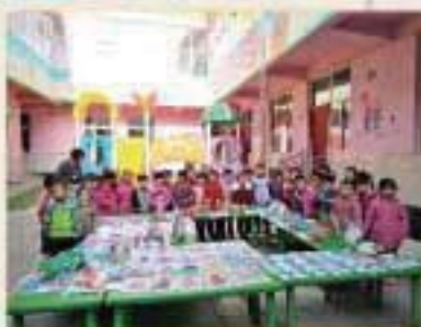
Children showing their drawings at the playground

We can now store children songs, animations and other educational materials in flash memory cards and show them to the children on television sets. Large size toys such as slides, mushroom shaped houses... bring much fun and joy to the children. These larger size toys also allow them to do exercises for muscle and body development, conditioning for a child's healthy growth. Air-conditioners provide the children a comfortable environment in both summer and winter. The parents are extremely pleased. These additions to our facilities also make us well prepared for the expansion of our service.