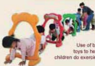
Use of big toys to help children do exercise

Thank you so much for your help. It's been a wonderful gift for us, and for the children! We will do our utmost for the disadvantaged children amongst us to contribute to their happy and healthy growth.