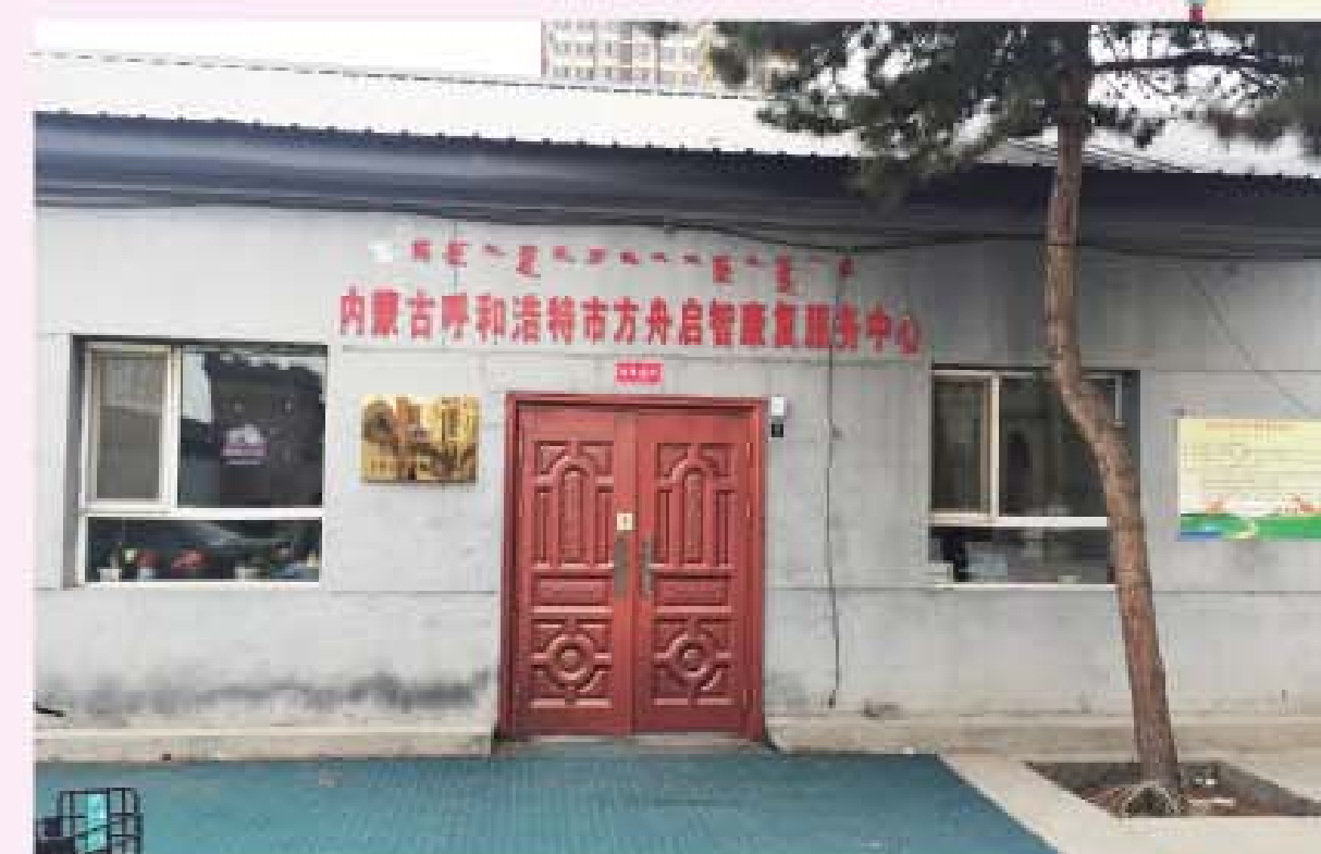
Front door of ARC

I am the manager of the Ark Rehabilitation Centre (ARC) in Huhehaote city, Inner Mongolia. An officially registered organization established in 2012, our Centre focuses on providing mental health rehabilitation services, special education and foster care services to children and teens with special needs. The staff consists of 3 teachers, an executive officer and 2 assistants. Currently, we are serving 20 kids aged between 13 and 19 years old. They include children with cerebral palsy, autism, hyperactivity disorder, Down syndrome, and other mental disabilities.