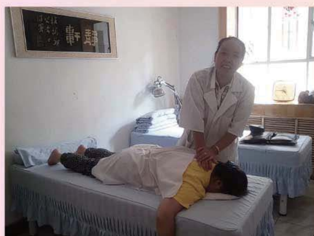
Massage and physiotherapy