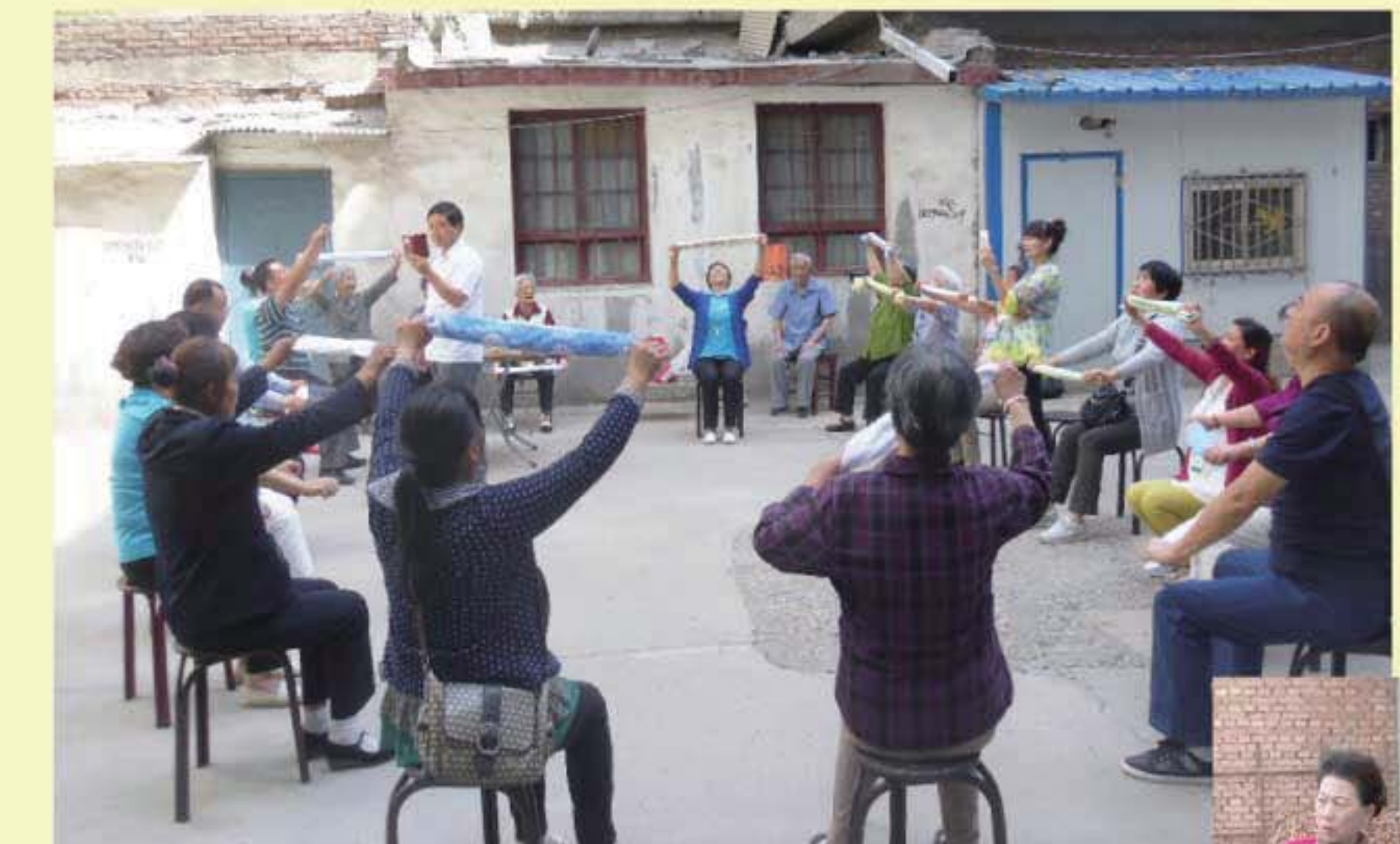
Various care services for elderly

The services provided by the Centre are so greatly welcomed and well-recognised by the people in Qilihe. Meanwhile, the sisters will never give up learning and are still striving for better results.