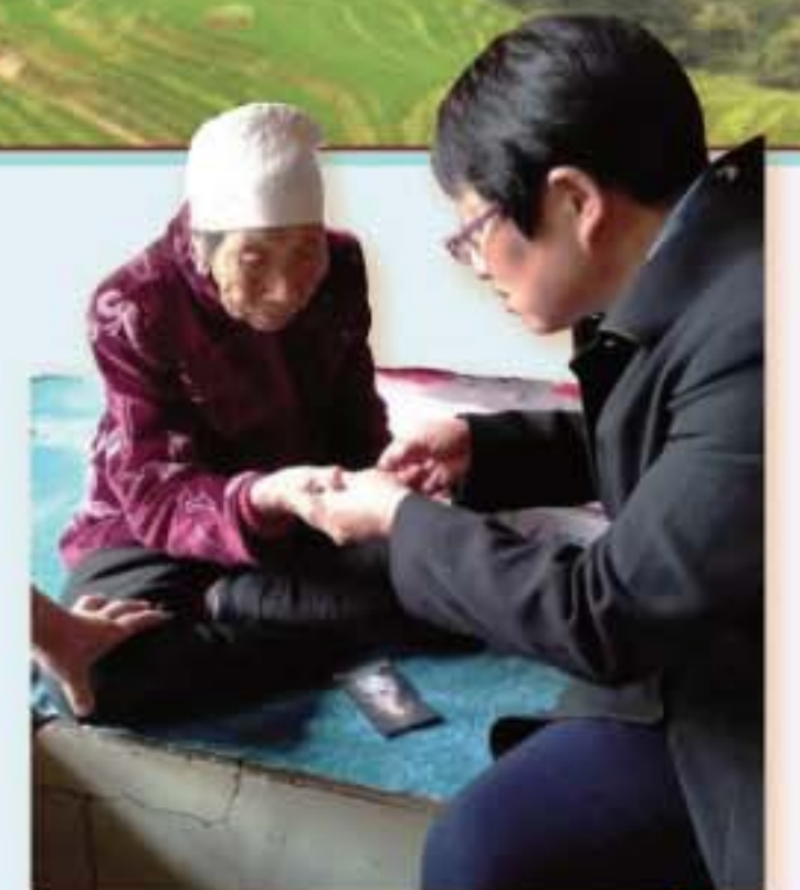
Care services for elderly

We are a group of religious sisters from Baotou in Inner Mongolia. We serve in a rural community where many of the young people left and worked in big cities, leaving behind a lot of elderly folks who lack care and support from family members. These old folks often feel lonely and depressed. They live off their meager savings, and sometimes limited subsidies from their children. The majority do not receive old age support from the government. Their quality of life and the state of their health are truly worrisome.