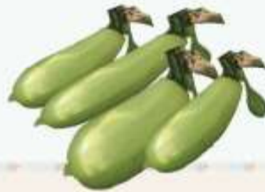
Different kinds of vegetables can be found here

The greenhouse we built 20 years ago was in such a poor shape that it was beyond repair. As a result, we needed to fall back on what we had been doing before we had the greenhouse; to ride our tricycle to town some 20 kilometers away every few days to buy the vegetables we needed. With your help, we now have a new greenhouse, and are again able to grow the vegetables for the children and elderly in our care.