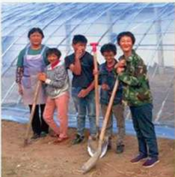
The sister and the children

The greenhouse we built 20 years ago was in such a poor shape that it was beyond repair. As a result, we needed to fall back on what we had been doing before we had the greenhouse; to ride our tricycle to town some 20 kilometers away every few days to buy the vegetables we needed. With your help, we now have a new greenhouse, and are again able to grow the vegetables for the children and elderly in our care.